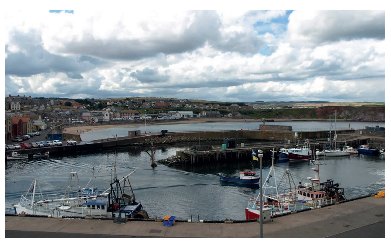
Fig. 4.1 for Question 4