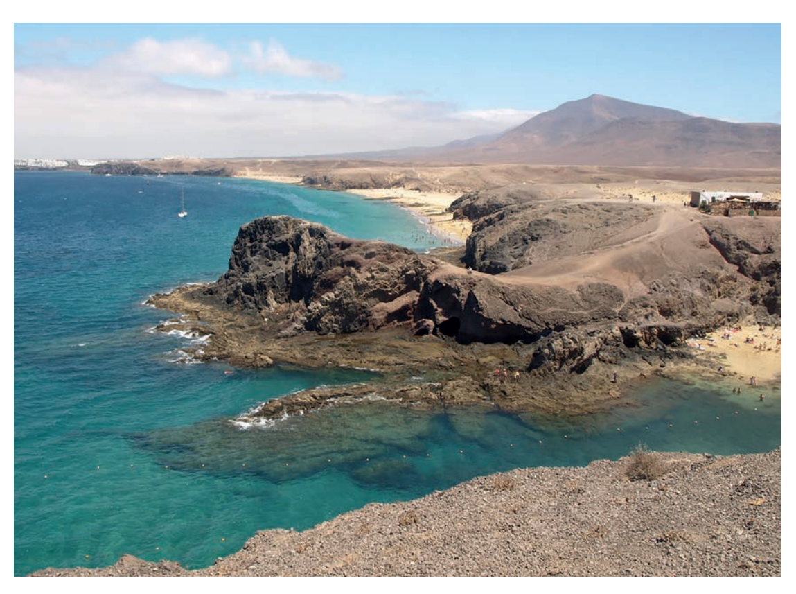
Fig. 6.2 for Question 6

The boundaries and names shown, the designations used and the presentation of material on any maps contained in this question paper/insert do not imply official endorsement or acceptance by Cambridge Assessment International Education concerning the legal status of any country, territory, or area or any of its authorities, or of the delimitation of its frontiers or boundaries.